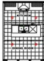
OPT/KITCHEN BEAMS OR LEFT LOBBY