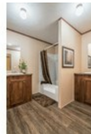
#13 Floor plan number: CLM102570TN

3 beds • 2 baths • 1056 sq.ft. • 16' width • 66' depth