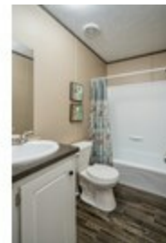
#19 Floor plan number: CLM101855TN

3 beds • 2 baths • 1216 sq.ft. • 16' width • 76' depth